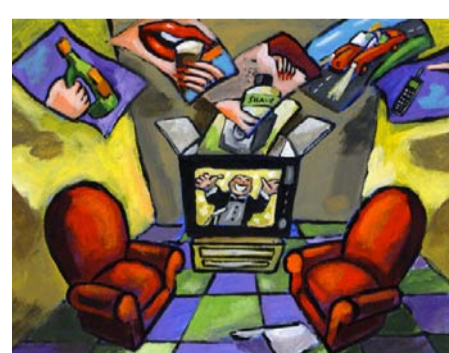
MARKETING & ADVERTISING BCC

225 East Las Olas Blvd. Bldg. 31, Room 306