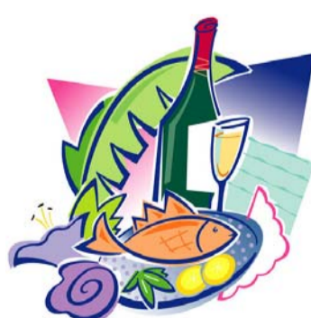
FOOD & BEVERAGE BCC

111 East Las Olas Blvd. Bldg. 33, Room 1208